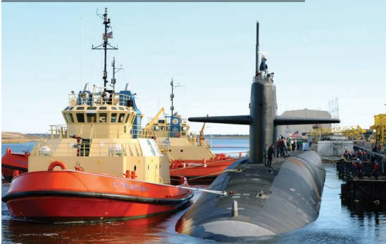
Kings Bay Naval Sub Base | Kings Bay, GA

Every day, ESG is actively delivering projects to federal clients across the country. With the ability to provide most facility types, ESG has a primary focus on energy resiliency and sustainment projects. We are experts in all types of energy, water conservation, and utility projects. ESG can support your program needs in the areas of general construction and specific energy project delivery.