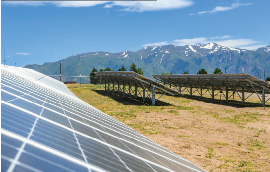
Hill Air Force Base | Ogden, UT

ESG has delivered more than $4B worth of projects to more than 500 CONUS clients. We have delivered projects from $1M to $262M. We are an FSCL holder and have worked at secure locations, including Kings Bay Naval Station and the Pentagon.